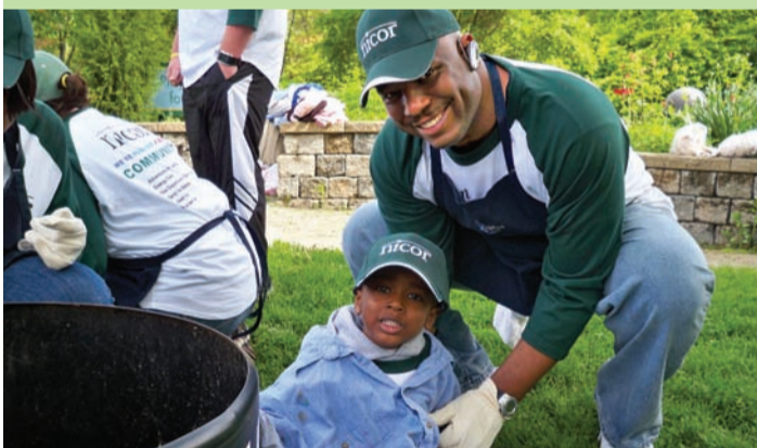
Brookfield Zoo offered family-friendly projects for volunteers of all ages during Volunteer Day on May 16.

More than 1,000 volunteers spread out across northern Illinois on May 16, 2009 to complete 24 projects in communities as part of our 13th annual Volunteer Day . Projects ranged from river and outdoor cleanup to painting and food sorting. In addition, Nicor provided $5,000 in capital grants to the Northern Illinois Food Bank in St. Charles and the DuPage Habitat for Humanity.