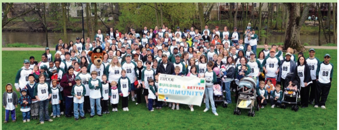
More than 450 Nicor walkers helped raise funds for March of Dimes at the annual March for Babies walk in Naperville.

Nicor began supporting March of Dimes in 1986, with a small team of walkers who raised $8,000. Throughout the years the company's walk team has continued to grow, and once again Nicor had the largest team at the Naperville site of the March for Babies walk on April 26, 2009. More than 450 walkers raised funds for the March of Dimes' fight against birth defects.