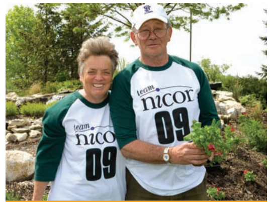
Community members help plant flowers in Worth as part of Nicor's 13th annual Volunteer Day on May 16.